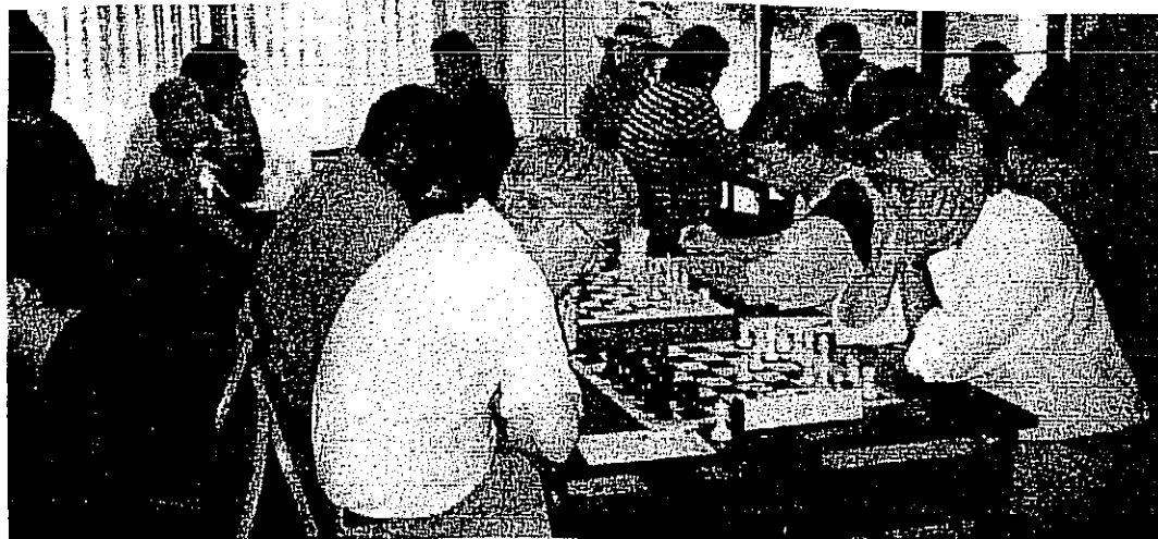
W.Va. Championship (Right)