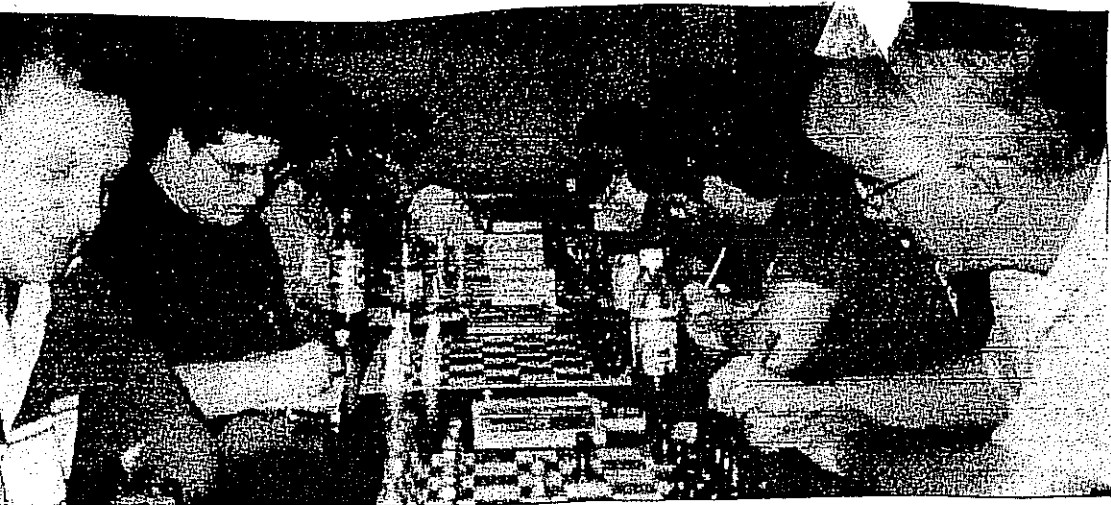
Parkersburg Homecoming (Left)