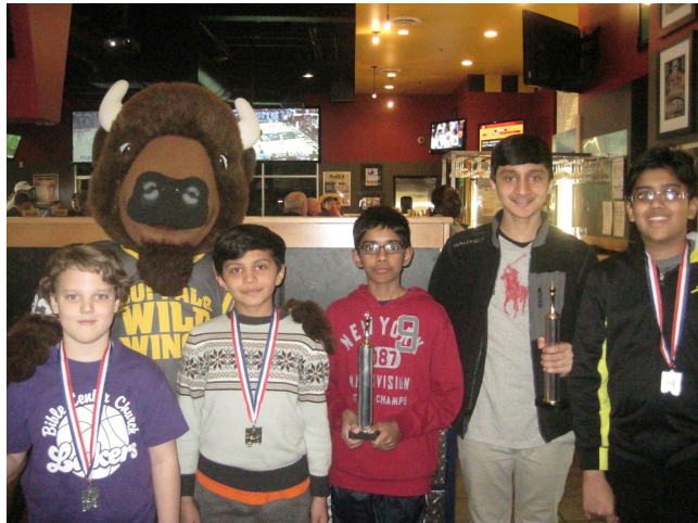
Winners of the Children's Home Chess Tournament.